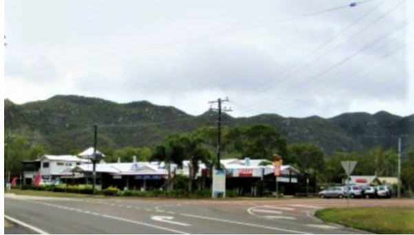
The IGA Supermarket is a 2 minute walk from the Marina

With approximately 3,000 residents on Magnetic Island, most trades are represented for vessel repair & maintenance. Plumbing, mechanics, carpentry, aircon/fridge, gas fitter, sailmaker (for patch jobs) and covers - ask the Marina office for contact numbers.